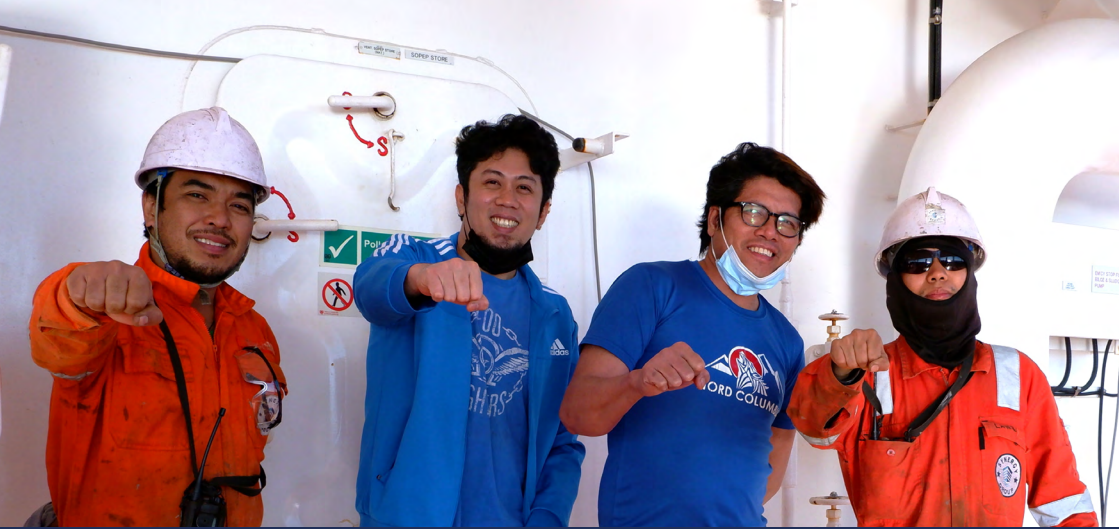
FILIPINO SEAFARERS - ALIGHT WITH SMILES

lationship with God. As Christians we do nothing to gain favour from God. Instead we do everything because we have already gained favour in the eyes of Holy God. This truth is life-changing for these men who come from a culturally dominant Roman Catholic tradition. And they need your prayers.