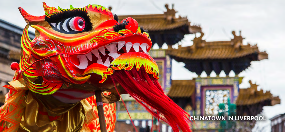
CHINATOWN IN LIVERPOOL